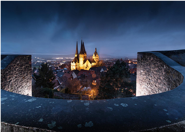
Fairy tale towns make for a high quality of life