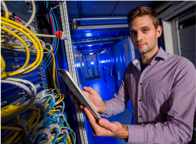
Digitalization and innovation ensure growth